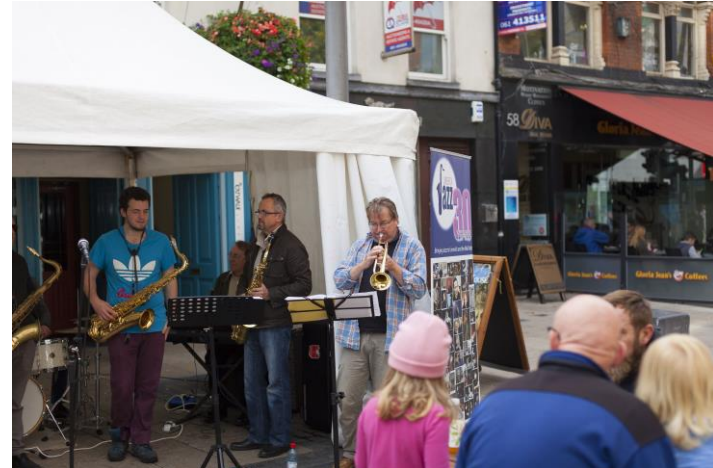
Limerick Jazz Workshop students perform on Thomas St. Limerick Jazz Festival 2016