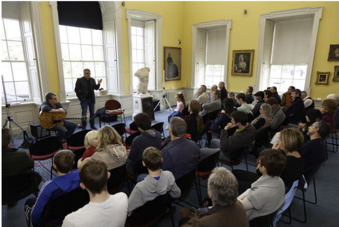
Linley Hamilton masterclass in Hunt Museum Limerick Jazz Festival 2016